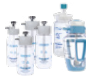
Humidifiers from p. 47