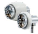
Oxygen Probes and Accessories from p. 55